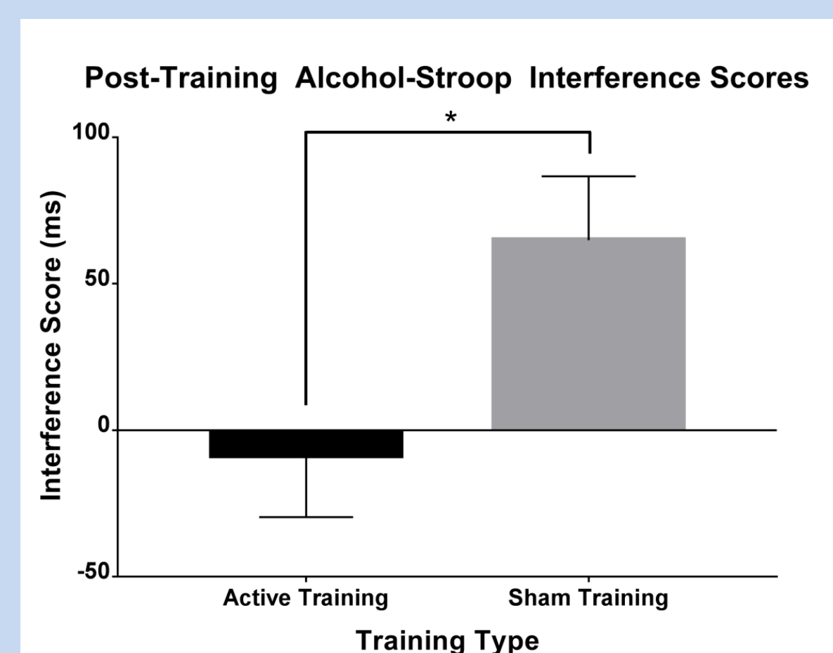
Figure 2: Post-Training Stroop Interference Scores

Consistent with our hypotheses, after ABM training, and when controlling for pre-training scores, participants in the active training condition exhibited significantly lower Stroop interference scores than participants in the sham training group, F(1,26) = 5.70, p = .025 .